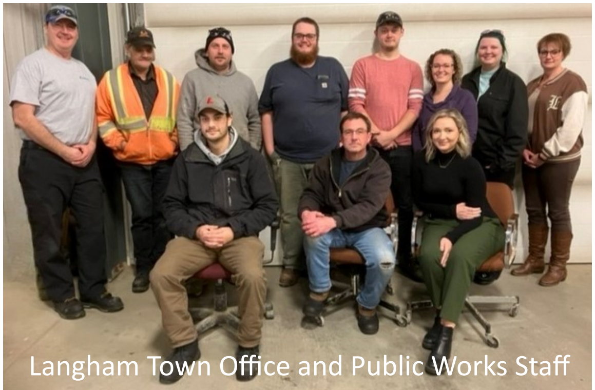
Langham Town Office and Public Works Staff