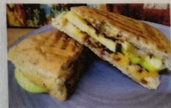
Apple Bacon Cheddar

Grilled panini with apples, bacon, cheese